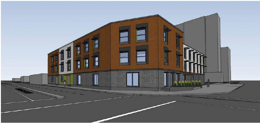
New complex coming to Melvin Avenue

A striking new project near the intersection of Parkdale and Barton promises to transform both a local landmark and the lives of the people who will live there.