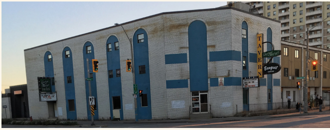
George & Mary's will make way for new complex

The rejuvenated property will provide a minimum of 56 affordable, accessible, energy-efficient apartments, 3,000 square feet of retail space and a large-scale teaching kitchen. Most of all, it will offer immense potential to improve the lives of its future residents. Results from Indwell's other projects show a number of improvements in tenants' situations, including an increase in housing stability by an average of 3.5 years, fewer required emergency services, improved mental and physical health, rebuilt family connections and an increase in community participation.